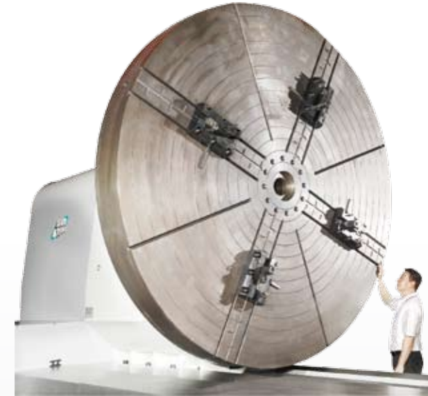
3000mm chuck with boring mail jaws