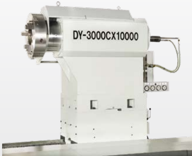
Hydraulic tailstock with rotating quill