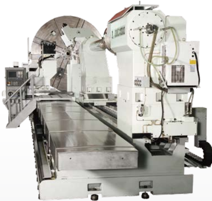
Telescopic cover for guide ways