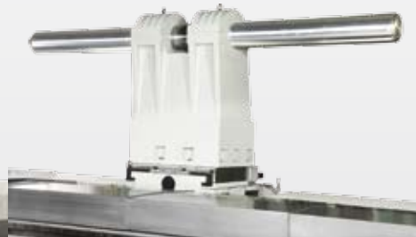
Boring bar holder