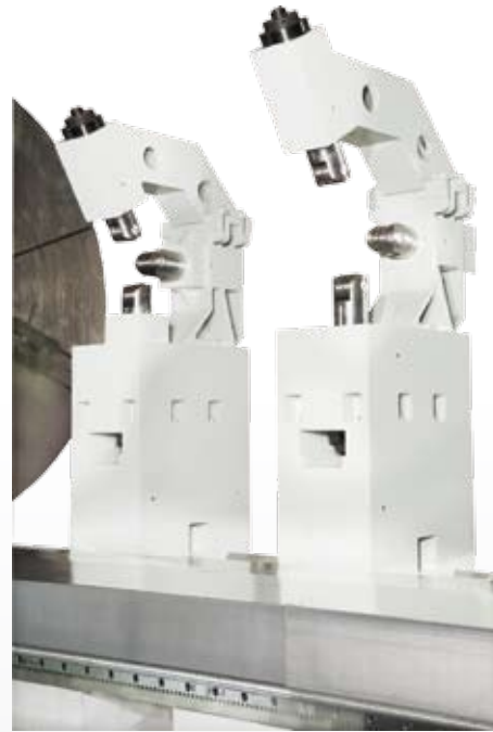
C type steady rest