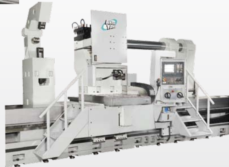
All kinds turret available